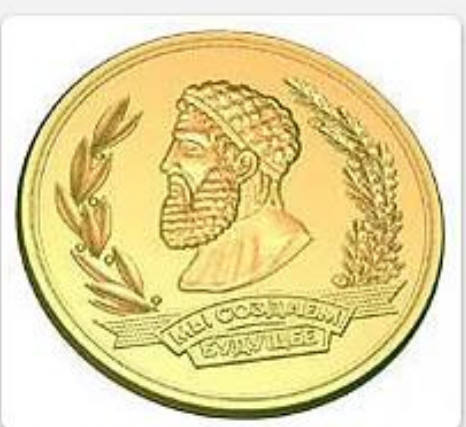
The gold medal of the International Salon "Archimedes"