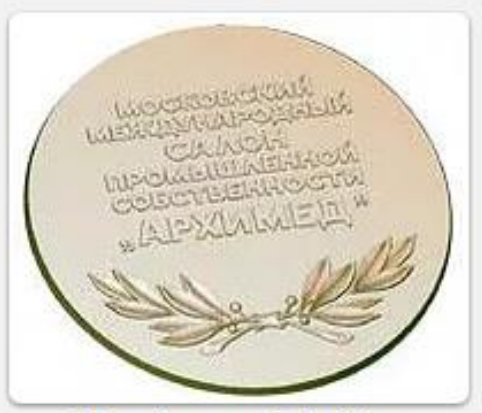
The silver medal of the International Salon "Archimedes"