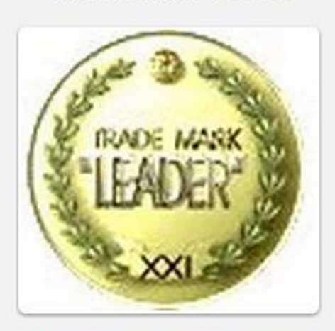
The gold medal of exhibitionpresentation "The trade mark - LEADER"