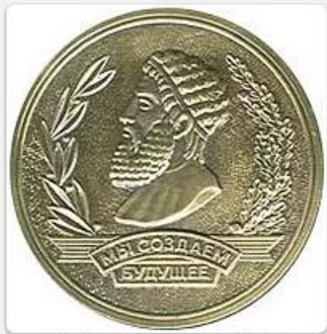
The bronze medal of the International Salon "Archimedes"