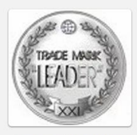
The silver medal of exhibitionpresentation "The trade mark - LEADER"