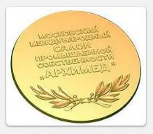
The gold medal of the International Salon "Archimedes"