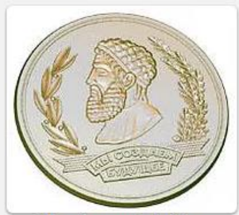
The silver medal of the International Salon "Archimedes"