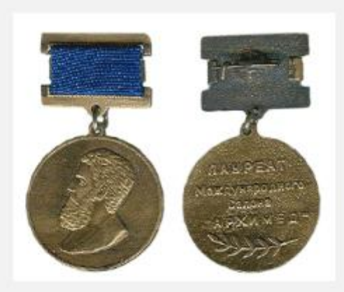
The winner of the International Salon "Archimedes"