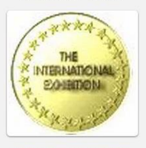
The gold medal of exhibitionpresentation "The trade mark - LEADER"