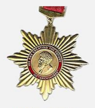
The order Grand Gold "Archimedes"