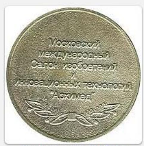
The bronze medal of the International Salon "Archimedes"