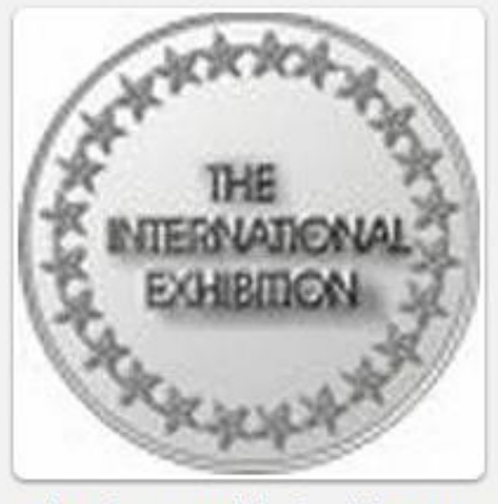
The silver medal of exhibitionpresentation "The trade mark - LEADER"