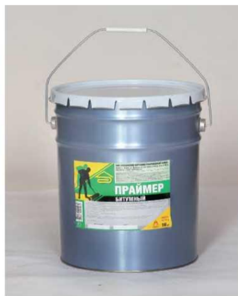
Guarantee storage period — 12 months from the production date.

The primer is packed into metal or platic hermetic containers (closed barrels, flasks, metal cans). The volume of containers filling is not more than 90%. Store in closed rooms, provided with supply-and-exhaust ventilation. The primer should be protected from moisture and direct sunbeams. By storage the layering of the primer is admitted.